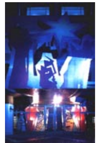
Detail of entry