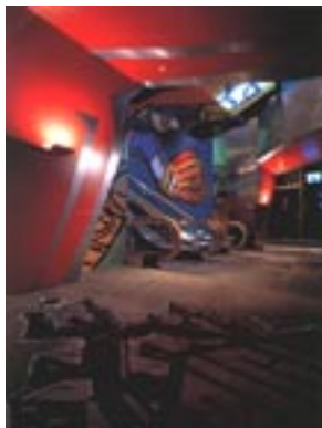
Detail of entry