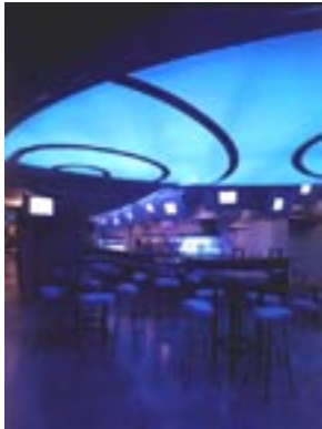
Detail of bar

This project has been termed, “the world’s longest sports bar” and covers a linear distance of over 200’ while being only 20’ wide. Its location at the end of a sports stadium offers privileged views to fans who want to watch a game and socialize. I worked on schematic design and design development drawings, and was active in the interaction between the architecture and the supergraphics. Once development drawings were completed they were sent to the Japanese contractor who generated complete working drawings that we approved before construction began. The final experience of the spaces was a collaboration of architectural and graphic design disciplines.