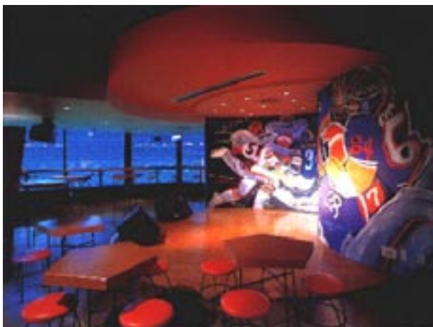
Detail of lounge