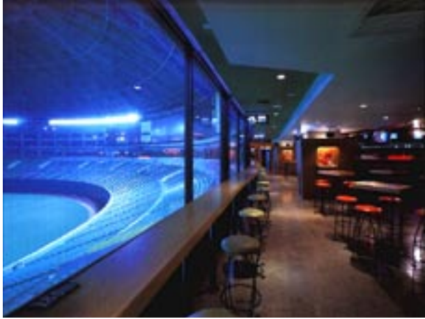
View to stadium

This project has been termed, “the world’s longest sports bar” and covers a linear distance of over 200’ while being only 20’ wide. Its location at the end of a sports stadium offers privileged views to fans who want to watch a game and socialize. I worked on schematic design and design development drawings, and was active in the interaction between the architecture and the supergraphics. Once development drawings were completed they were sent to the Japanese contractor who generated complete working drawings that we approved before construction began. The final experience of the spaces was a collaboration of architectural and graphic design disciplines.