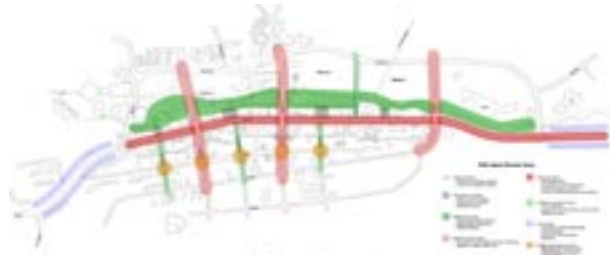
Character assessment framework plan

Breckenridge is a historic mountain town challenged with land use and transportation issues. With significant undeveloped sites in the center of the town, there is development pressure and the lack of an integrated transit system has crippled movement patterns during the tourist season. As part of a multi-disciplinary consultant team, Tom led the development of an urban design framework plan including the preparation of an overall vision, framework principles and associated design strategies. The principles were used to identify character zones and an improved land use and connection strategy and led directly to the recommendation of future projects.