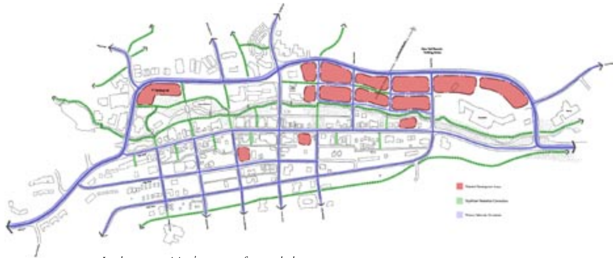
Land use, connectivity & open space framework plan

Breckenridge is a historic mountain town challenged with land use and transportation issues. With significant undeveloped sites in the center of the town, there is development pressure and the lack of an integrated transit system has crippled movement patterns during the tourist season. As part of a multi-disciplinary consultant team, Tom led the development of an urban design framework plan including the preparation of an overall vision, framework principles and associated design strategies. The principles were used to identify character zones and an improved land use and connection strategy and led directly to the recommendation of future projects.