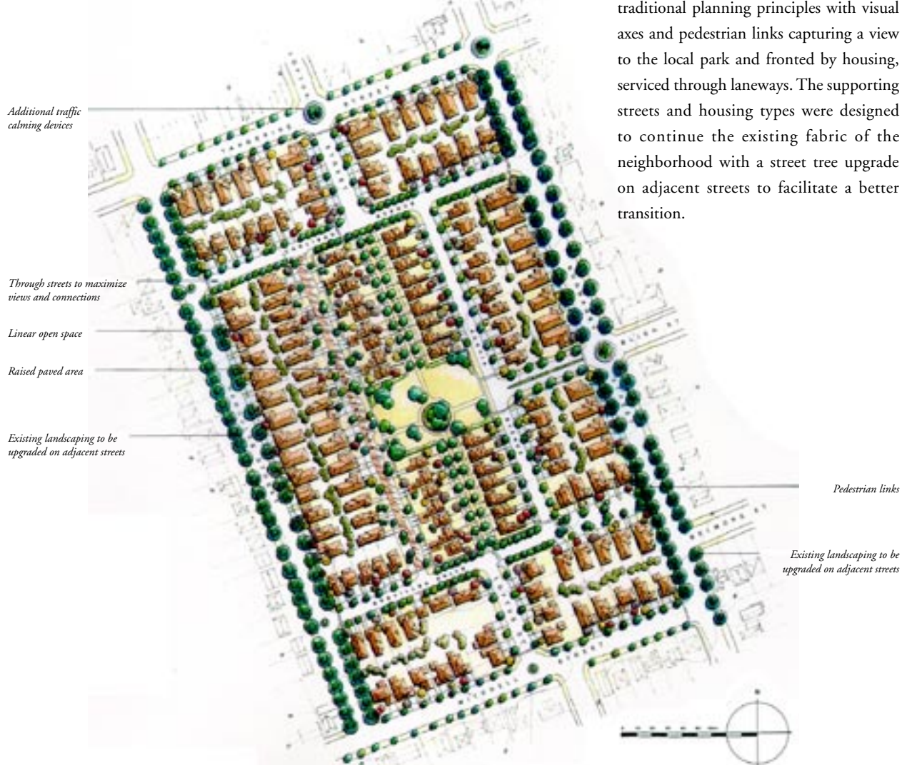
Master Plan (By EDAW design team)

The East Fairfield site is approximately 8.28 ha, rectangular in shape with frontage and access from all existing streets and is relatively flat. My responsibility was to work with the residential developer, Bellevale Homes, to produce an urban residential master plan for Landcom, a state government agency. The precinct accommodates approximately 500 residents and a local park. The precinct is based on traditional planning principles with visual axes and pedestrian links capturing a view to the local park and fronted by housing, serviced through laneways. The supporting streets and housing types were designed to continue the existing fabric of the neighborhood with a street tree upgrade on adjacent streets to facilitate a better transition.