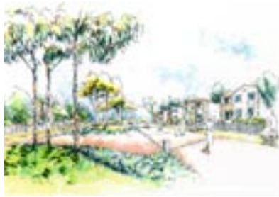
Perspective (by EDAW design team)

The East Fairfield site is approximately 8.28 ha, rectangular in shape with frontage and access from all existing streets and is relatively flat. My responsibility was to work with the residential developer, Bellevale Homes, to produce an urban residential master plan for Landcom, a state government agency. The precinct accommodates approximately 500 residents and a local park. The precinct is based on traditional planning principles with visual axes and pedestrian links capturing a view to the local park and fronted by housing, serviced through laneways. The supporting streets and housing types were designed to continue the existing fabric of the neighborhood with a street tree upgrade on adjacent streets to facilitate a better transition.