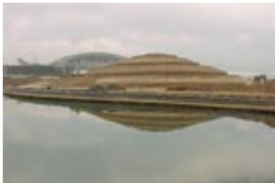
Construction photo of the Southern Marker