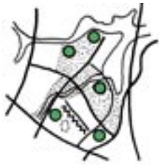
Location of the five Markers

The Millennium Parklands form one of the largest public parks in the world that provides Sydney with a collection of world class urban spaces. The concept for the park was developed by Peter Walker and Partners. Within the Parklands, and surrounding the Olympic facilities, are five conical shaped landforms called the Millennium Markers, which are in contrast to the more naturalistic setting of the Parklands. During the Olympic events the Markers will be planted with vibrantly colored flowers with post-Olympic treatments providing an easily maintained landscape. EDAW has been commissioned to provide design development through to construction administration for the Markers. As project manager for this $4.6 million project, my responsibilities were to work with the design team including sub-consultants to lead all aspects of the project including the design development and documentation phases as well as administrative tasks including project coordination, financial tracking and client meetings.