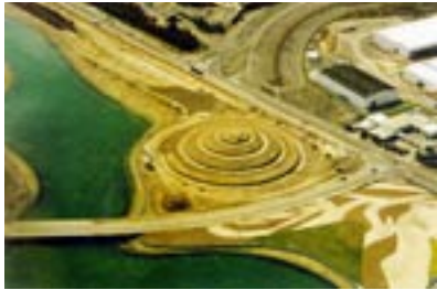
Aerial view of the Southern Marker

The Millennium Parklands form one of the largest public parks in the world that provides Sydney with a collection of world class urban spaces. The concept for the park was developed by Peter Walker and Partners. Within the Parklands, and surrounding the Olympic facilities, are five conical shaped landforms called the Millennium Markers, which are in contrast to the more naturalistic setting of the Parklands. During the Olympic events the Markers will be planted with vibrantly colored flowers with post-Olympic treatments providing an easily maintained landscape. EDAW has been commissioned to provide design development through to construction administration for the Markers. As project manager for this $4.6 million project, my responsibilities were to work with the design team including sub-consultants to lead all aspects of the project including the design development and documentation phases as well as administrative tasks including project coordination, financial tracking and client meetings.