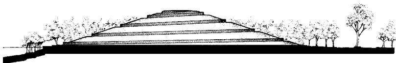
Section of the Southern Marker