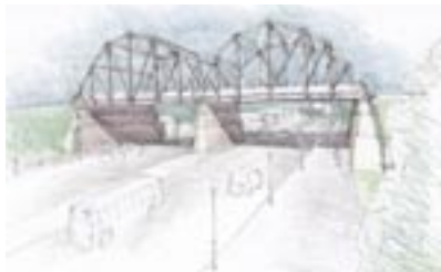
Proposed new highway bridge (drawn by others)