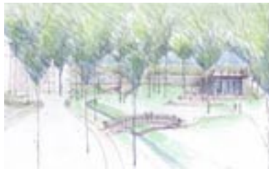
Proposed park improvements (drawn by others)

Olathe, the fastest growing city in the state, is the Johnson County government seat with most of the downtown buildings serving county and local government functions. Urban renewal efforts in the 1960s and 1970s removed many of the historic urban patterns and character, including the removal of buildings and the establishment of superblocks. Typical of many suburban areas, the downtown core had not seen any investment since urban renewal, with all new investment located in more distant fringe areas. The city had prepared previous master plans with insufficient implantation plans to carry out approved recommendations.