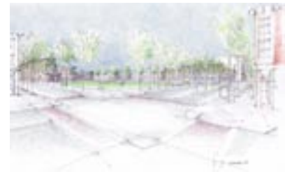
Proposed Town Square (drawn by others)

To view the master plan as an Acrobat PDF file, go to www.hesterstudio.com