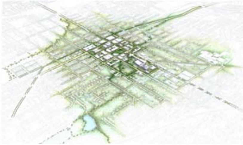
Illustrative view showing recommendations