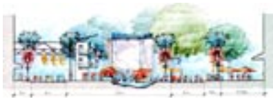
Section through proposed theater space

EDAW is currently working with the Jerde Partnership, OMA, Wet Design and others to help reestablish Orchard Road as a world class street and urban environment. The road is a main arterial from the CBD. As Singapore's shopping district, the grain of Orchard Road is comprised of large internal malls with some small, street focused shops. The existing street edge is separated both vertically and horizontally from traffic with devices such as large 3 meter wide planting strips. These conditions disengage pedestrians and do not provide for a vibrant street life. As part of the EDAW team, my responsibilities included the development of conceptual strategies and the production of preliminary design plans and sections for presentation to the client.