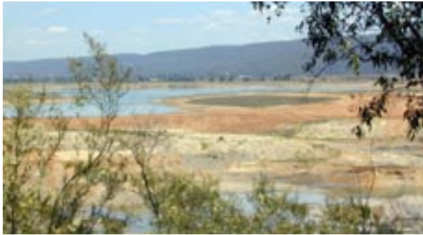
View of existing property

The Penrith Lakes site is located in Western Sydney and is comprised of 1,900 hectares of land within a flood plain. The land has been used for quarrying operations and has supplied approximately half of Sydney's annual sand and gravel requirements, and is now the home of the Olympic Rowing Course for the 2000 games. EDAW was engaged by the Medallist Corporation to aid in their bid to develop the Penrith Lakes site. My responsibilities were to coordinate with our client and his consultants, who included, a South Australian housing developer and Greg Norman Golf Courses, and to identify and evaluate suitable development options. The preferred study contained mixed-use, educational, residential, community and recreational uses including a golf course and water based uses.