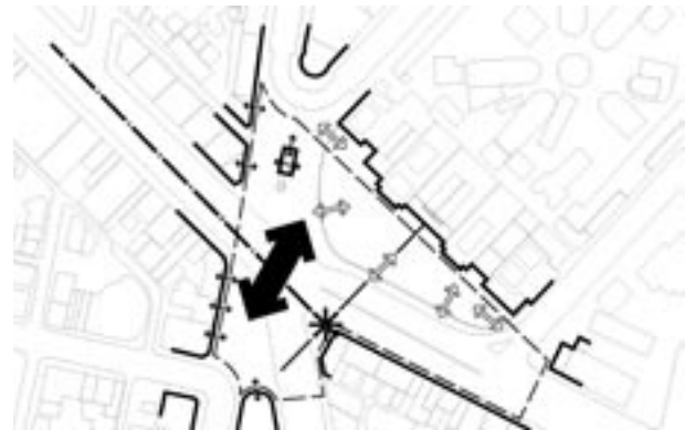
Key design principles

The street closures produced 2 large public domain areas separated by heavily trafficked and noisy streets.