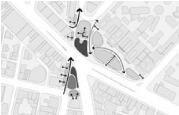
Function and use

The community workshop affirmed the desire to unify the Square, provide cafe spill-out and integrate the Courthouse forecourt into the public domain.