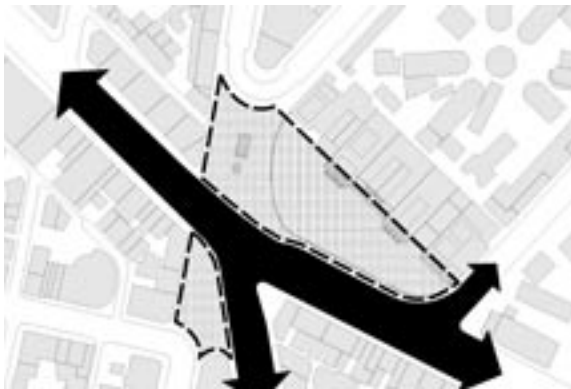
Taylor Square context

Taylor Square is a significant public space in South Sydney and is adjacent to the Sydney Central Business District. The Square has pubs and cafes to the south and east with the Supreme Court of New South Wales to the north. The construction of the Eastern Distributor tunnel necessitated traffic re-configurations and the closure of one of the roads, dramatically changing the continuity of the space and provided two large public spaces trisected by two arterial roads. EDAW was commissioned to conduct an Urban Design Study and produce a Master plan and Development Control Plan to aid Council in strategic redevelopment efforts. A community workshop was held to define the overall vision and desired future character statements.