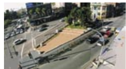
Existing traffic island